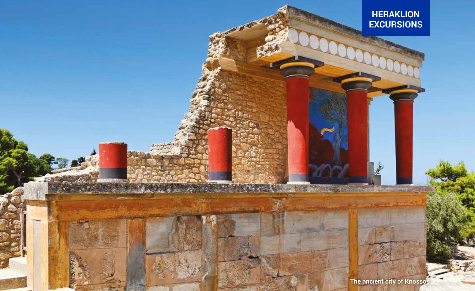
The ancient city of Knossos