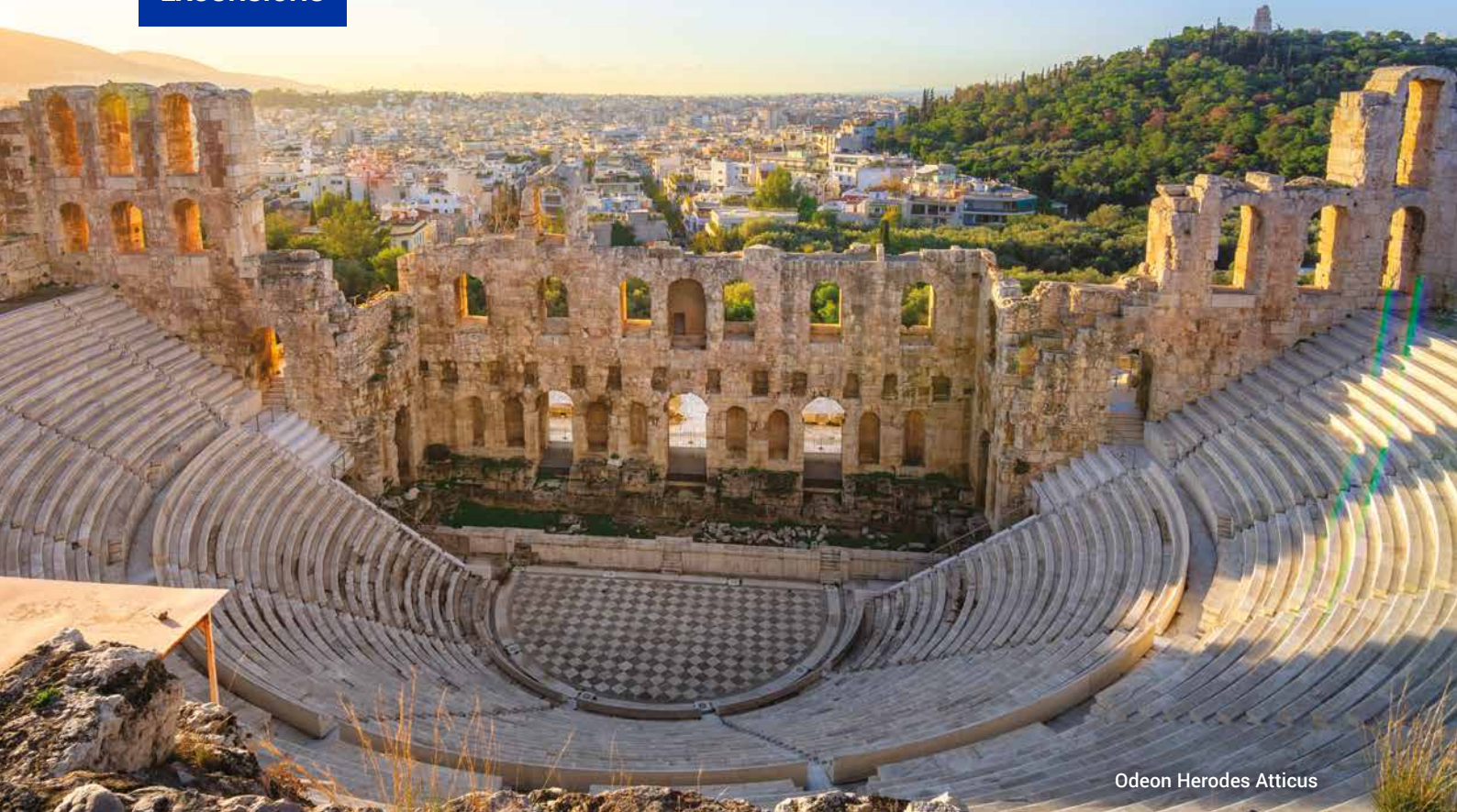
Odeon Herodes Atticus