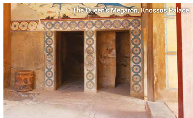
The Queen's Megaron, Knossos Palace

We end at the Archaeological Museum of Heraklion to find out more of the background to the history and culture of Crete.