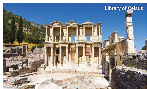
Library of Celsus