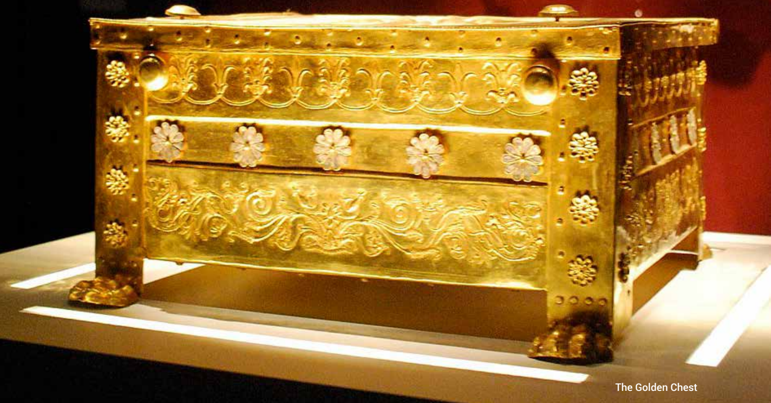
The Golden Chest