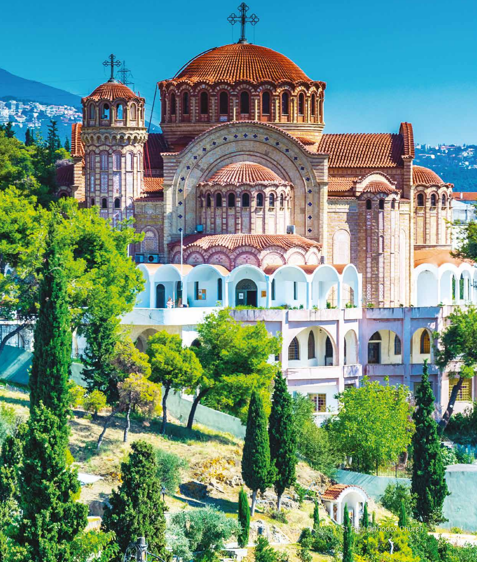
St Paul Orthodox Church