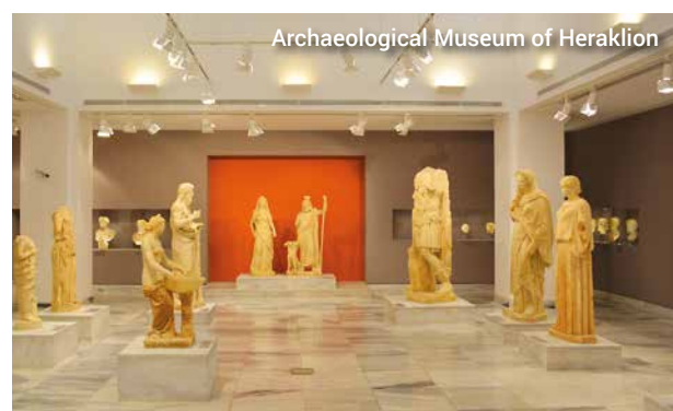
Archaeological Museum of Heraklion