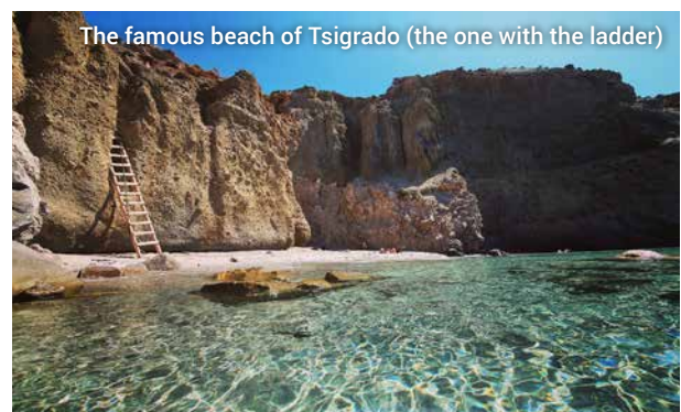
The famous beach of Tsigrado (the one with the ladder)