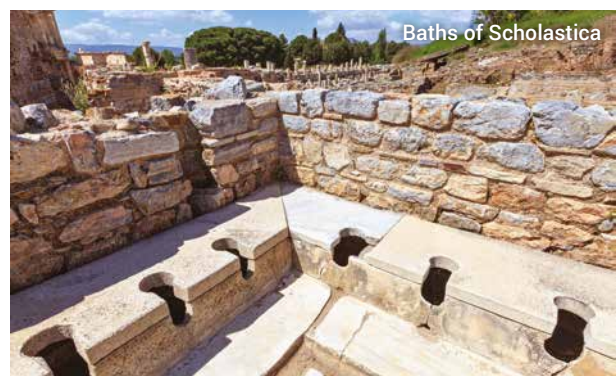
Baths of Scholastica