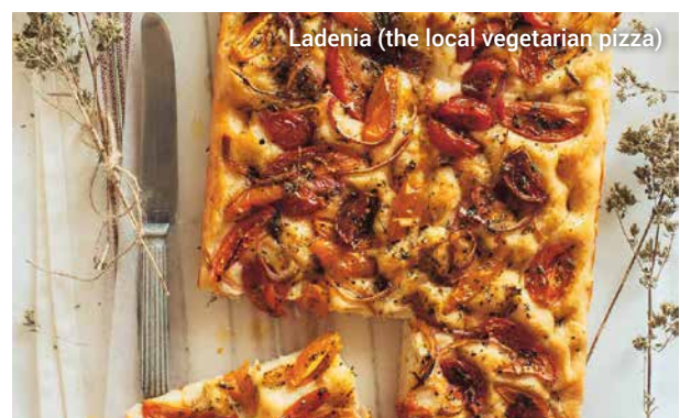
Ladenia (the local vegetarian pizza)

The memories are just waiting to be made on Milos.