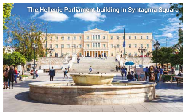
The Hellenic Parliament building in Syntagma Square

Our excursion concludes with free time at the resort of Isthmia.