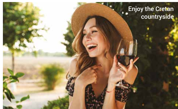
Enjoy the Cretan countryside

wonderful structures including the 'Koules' fortress, Venetian Loggia, Basilica of St Mark, medieval monastery of St Catherine and the Cathedral of Agios Minas.