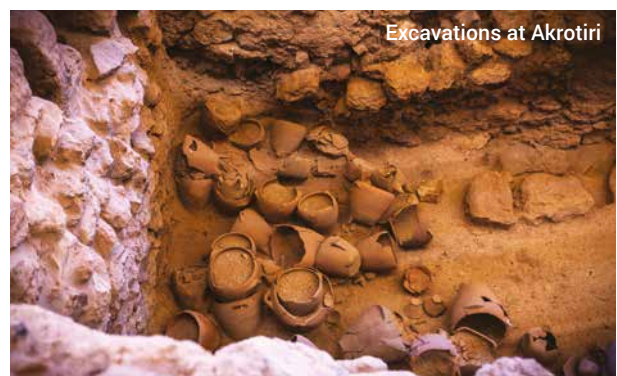
Excavations at Akrotiri

Tour may not be available at certain times of the year.