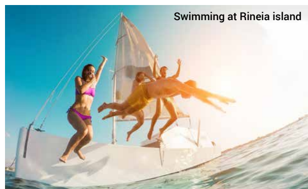
Swimming at Rineia island