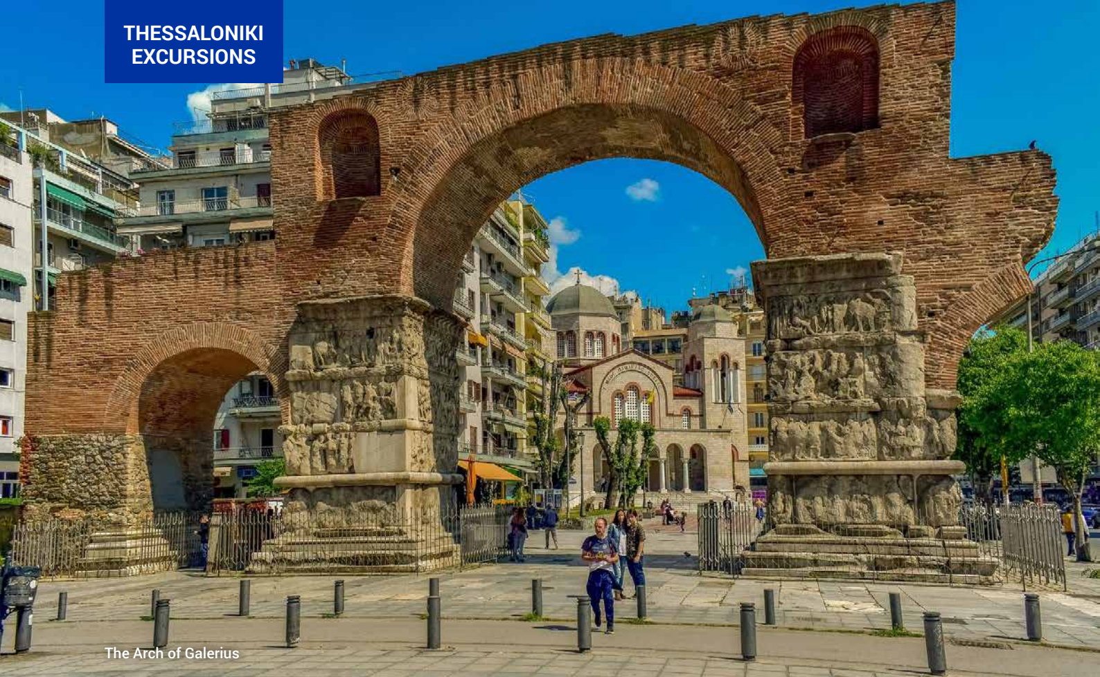
The Arch of Galerius