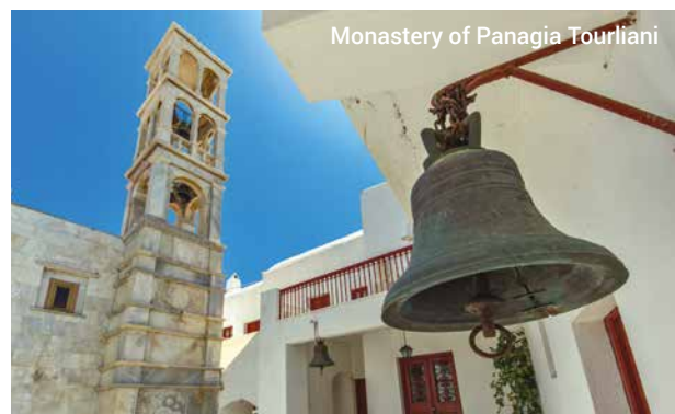
Monastery of Panagia Tourliani

Tour may not be available at certain times of the year.