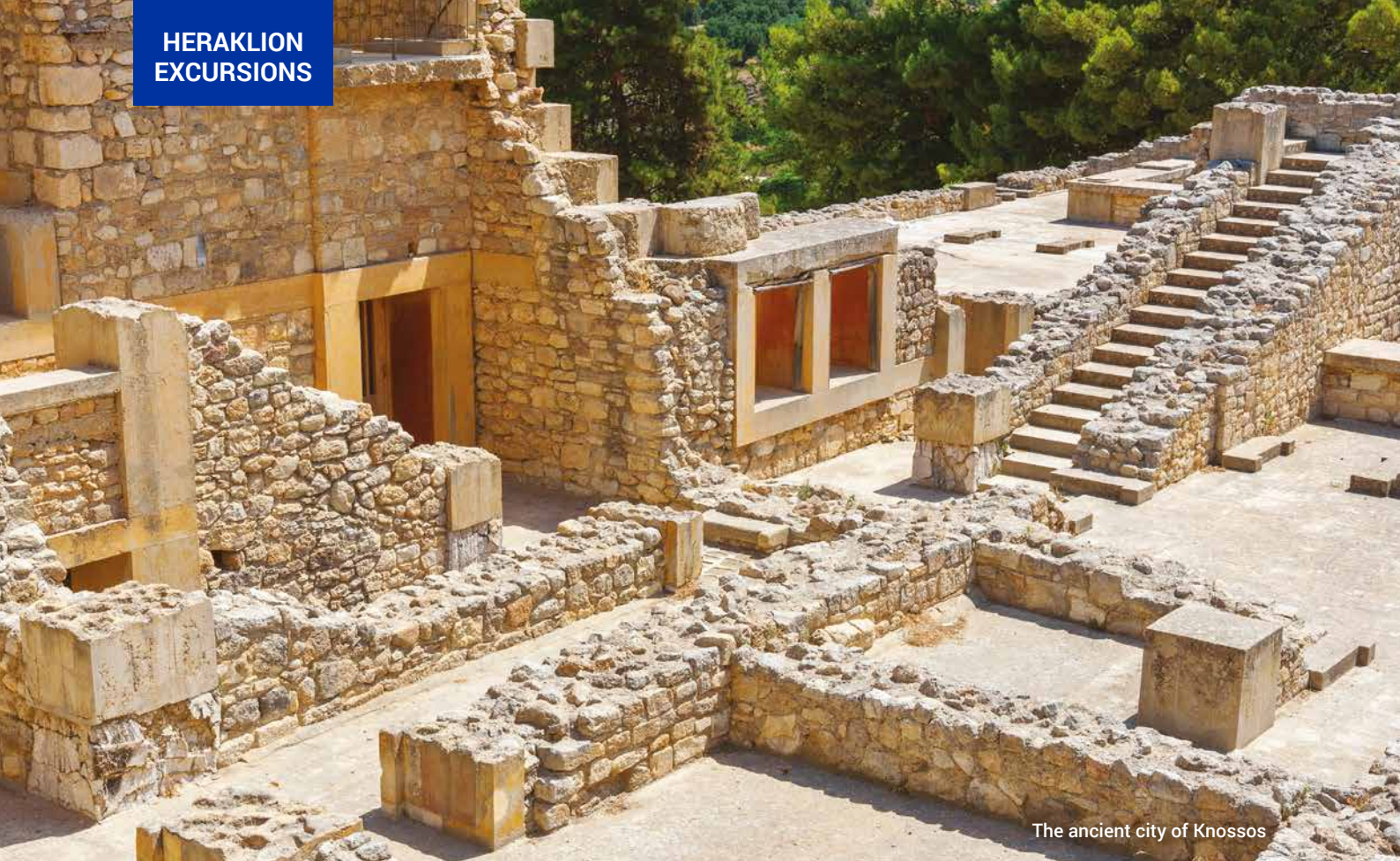
The ancient city of Knossos