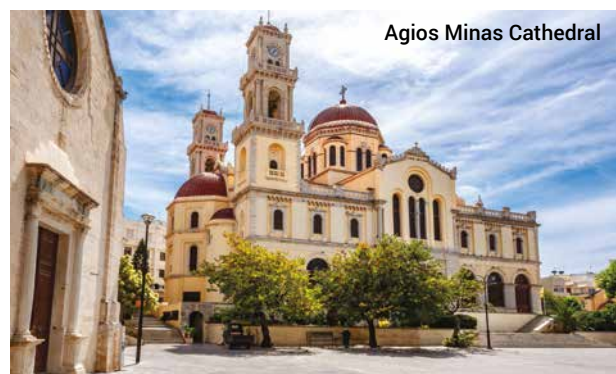
Agios Minas Cathedral