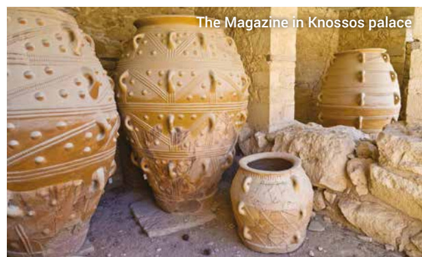
The Magazine in Knossos palace