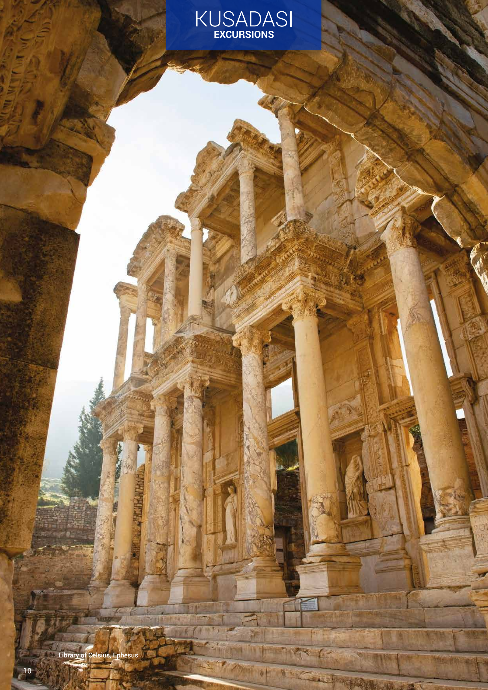
Library of Celsus, Ephesus