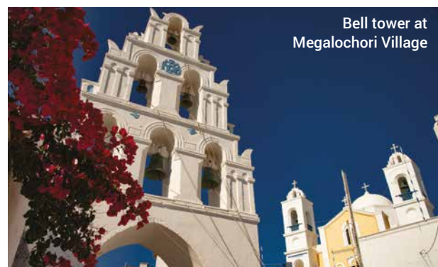
Bell tower at Megalochori Village