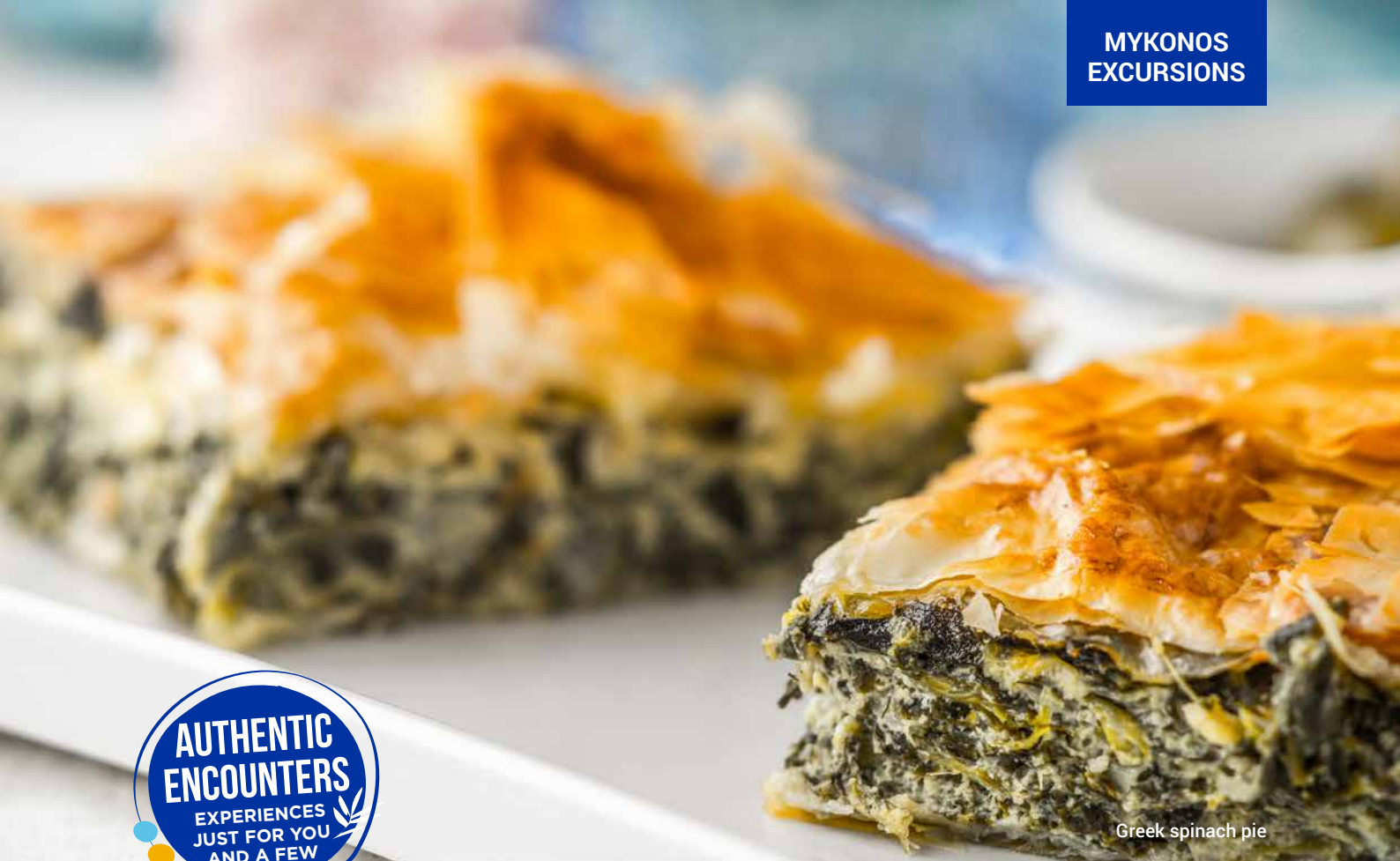
Greek spinach pie