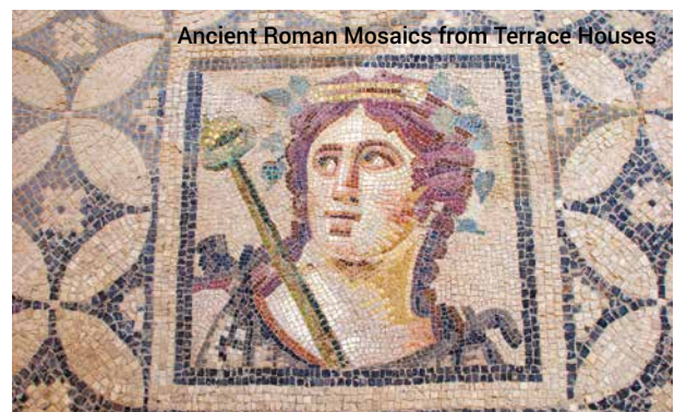
Ancient Roman Mosaics from Terrace Houses

Our tour includes time to shop for souvenirs, carpets, jewellery, leather and other goods.