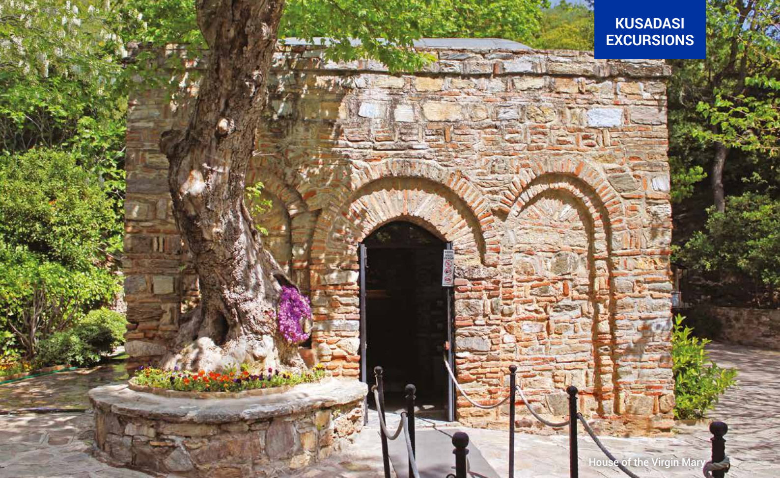
House of the Virgin Mary