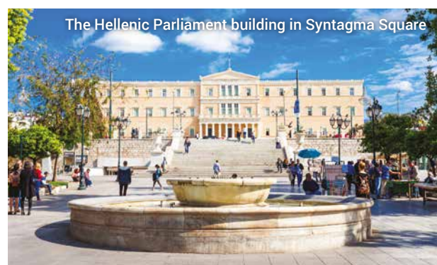
The Hellenic Parliament building in Syntagma Square

At the end of our journey we hope you will have a full appreciation of the glories of classical Athens and a sense of one of the most historically important capitals in the world.