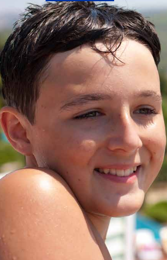
Adaland Water Park