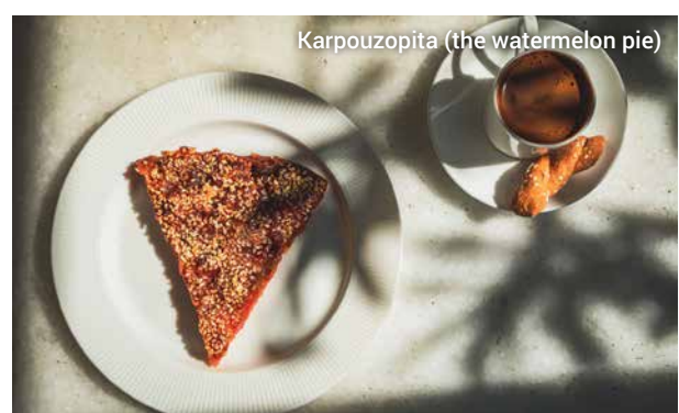
Karpouzopita (the watermelon pie)