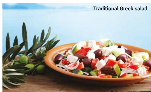
Traditional Greek salad