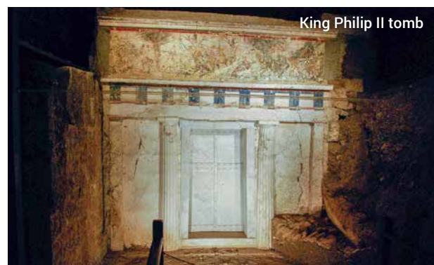
King Philip II tomb

The area was awarded UNESCO World Heritage Site status as "an exceptional testimony to a significant development in European civilisation."