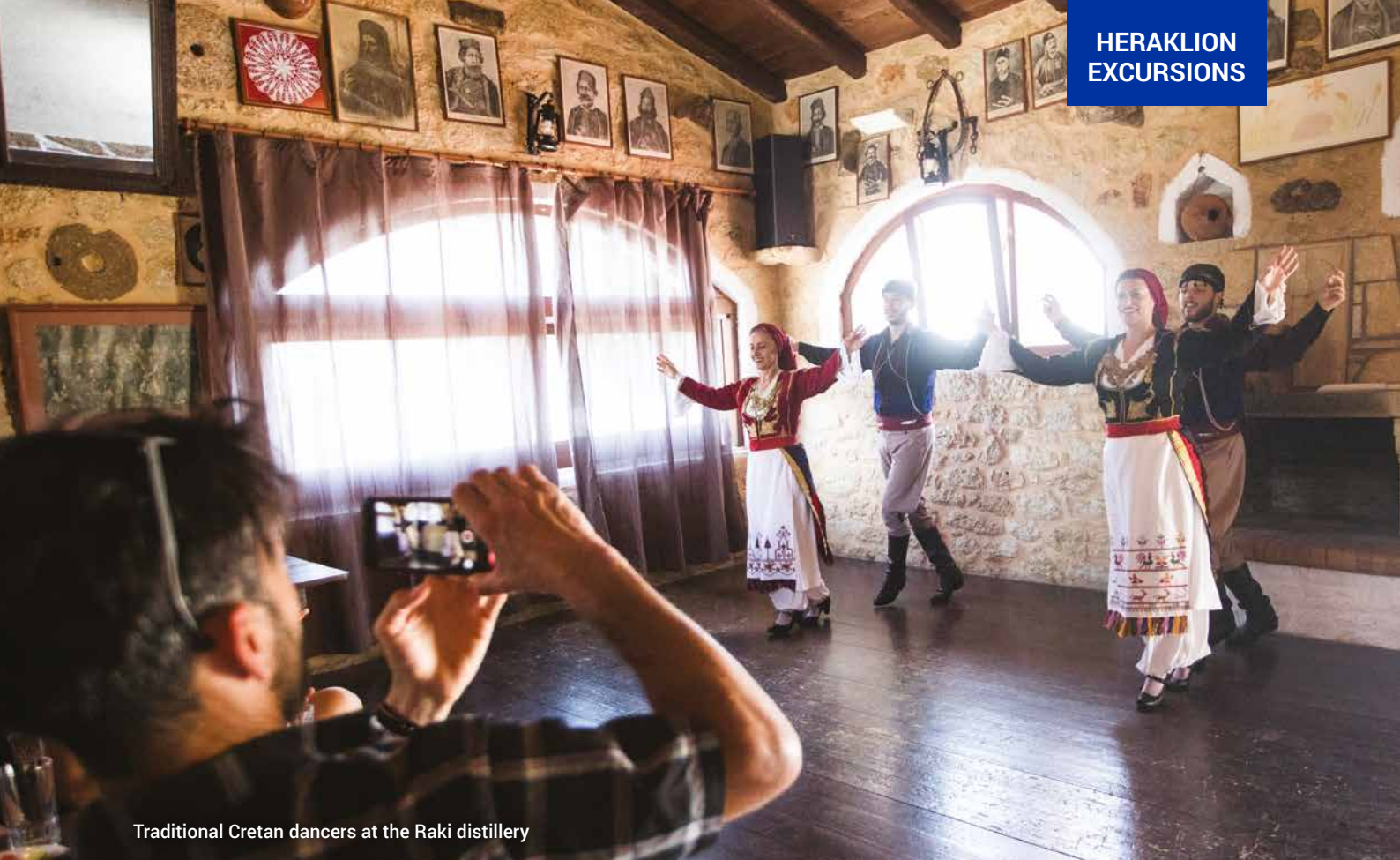
Traditional Cretan dancers at the Raki distillery