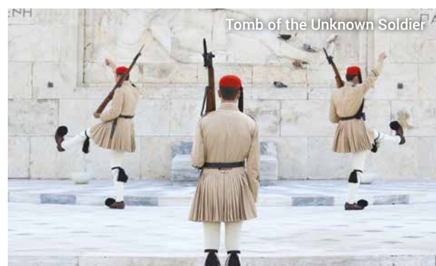
Tomb of the Unknown Soldier