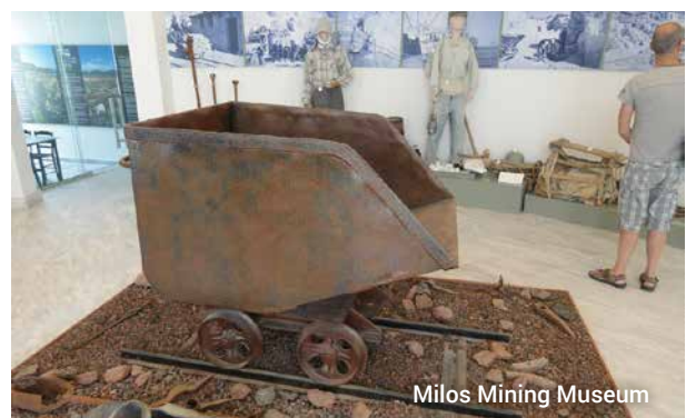
Milos Mining Museum

The breathtaking tour is around five hours, with the trek taking three hours.