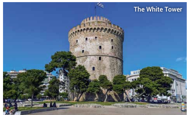
The White Tower

We visit the 5th century St. Demetrius' Cathedral as well and stop up to the Upper Town for sweeping views of the city with Mount Olympus and the Thermaic Gulf in the background.