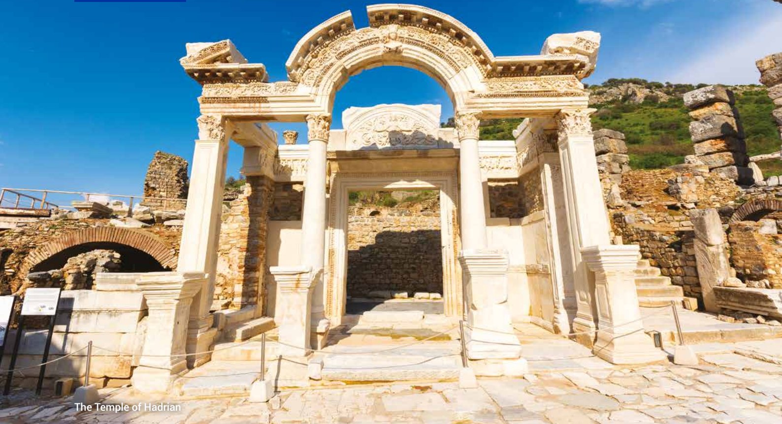
The Temple of Hadrian