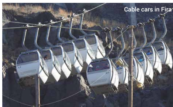
Cable cars in Fira

At the coastal village of Kamari on the coast we will have free time to stroll along the beach that comes to the foot of the Mesa Vouno mountain, rising up to 400m. Once an agricultural and fishing village, modern Kamari boasts a thriving tourist industry, offering a wide choice of restaurants, cafes and bars and several water sports activities. The excursion ends in Fira where we make our way down to the harbour side by cable car.