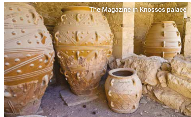
The Magazine in Knossos palace

Exploring from room to room we will relive time in the Hall of the Royal Guard and the King's Chamber, hearing about the extraordinary rule of King Minos.