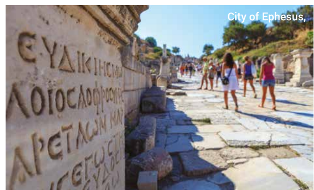
City of Ephesus,

Ephesus is one of the largest, most fascinating and most inspiring open-air archaeological museums in the world. This is an excursion you are unlikely to forget.