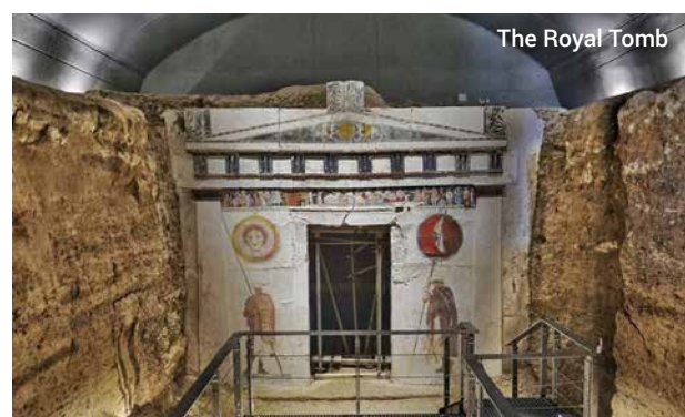
The Royal Tomb