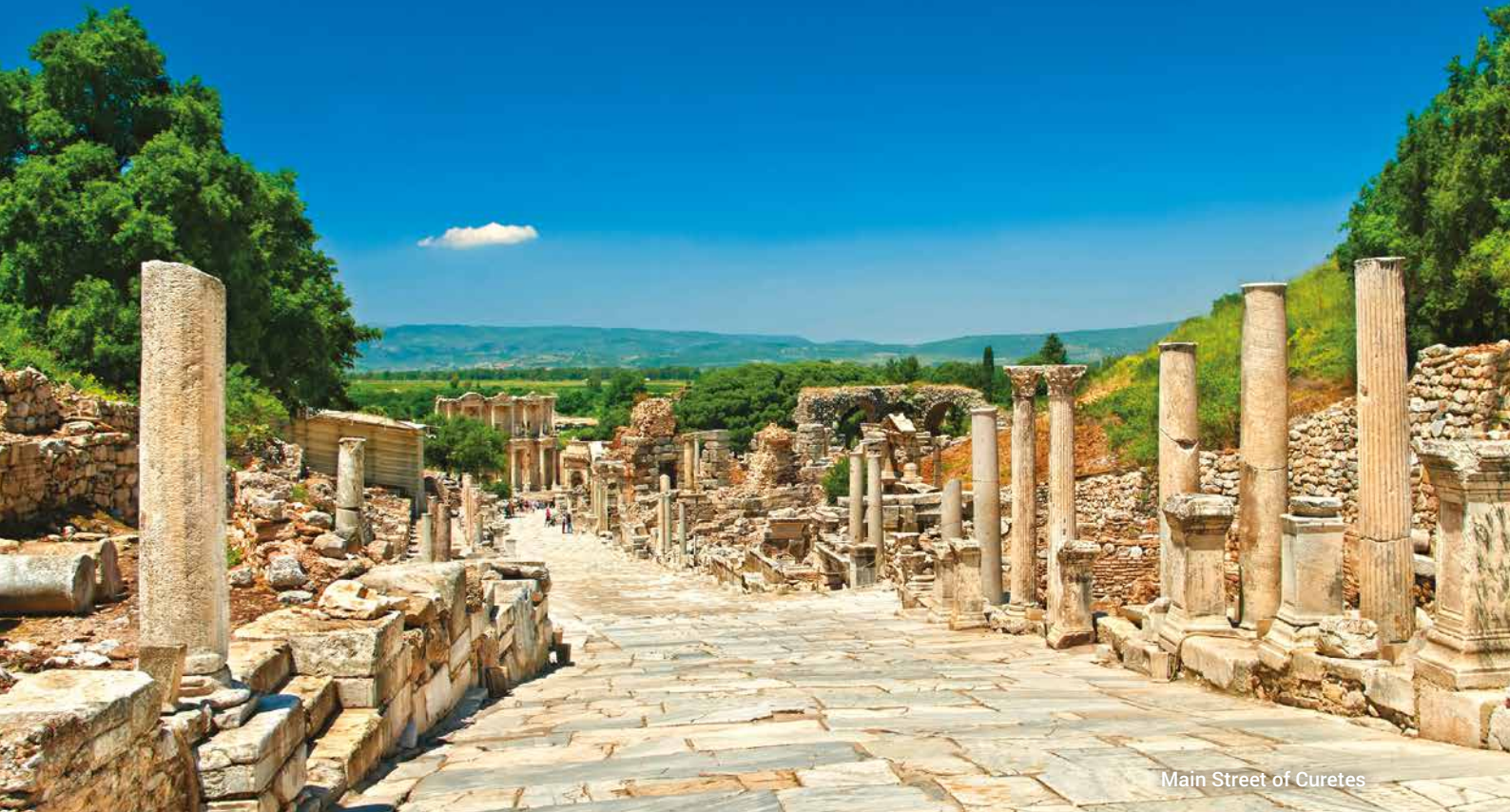
Main Street of Curetes